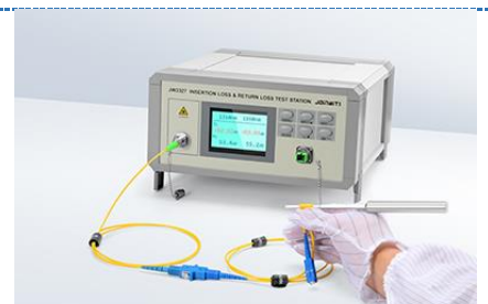
Return Loss Testing