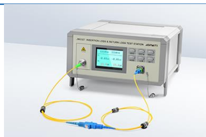
Insertion Loss Testing